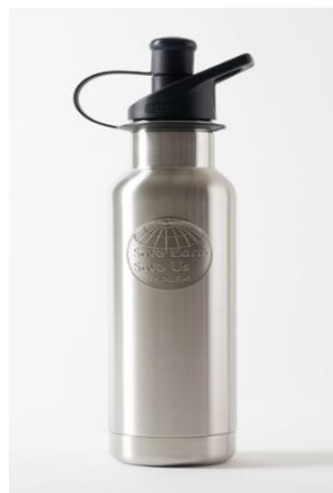
Vacuum Stainless Steel 550ml (insulated)