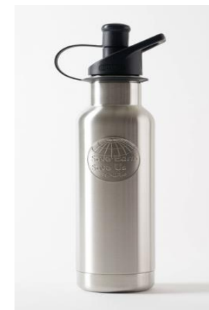
Vacuum Stainless Steel 550ml (insulated)